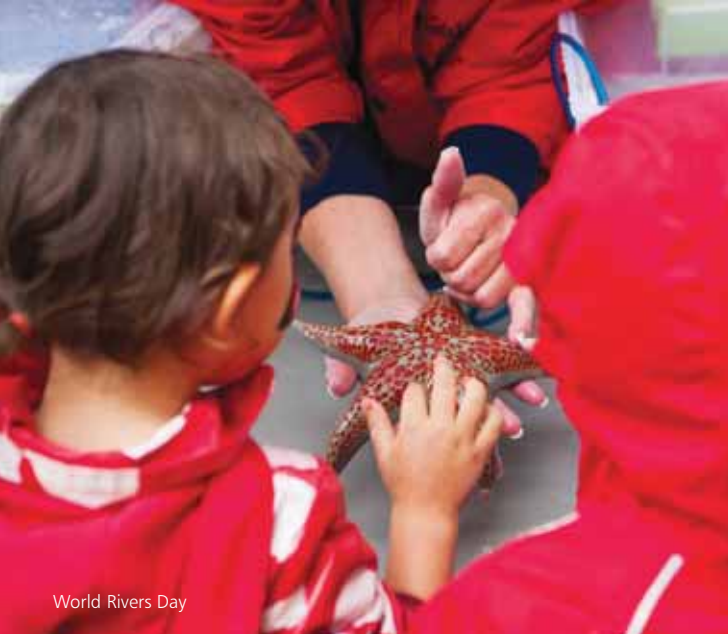
World Rivers Day