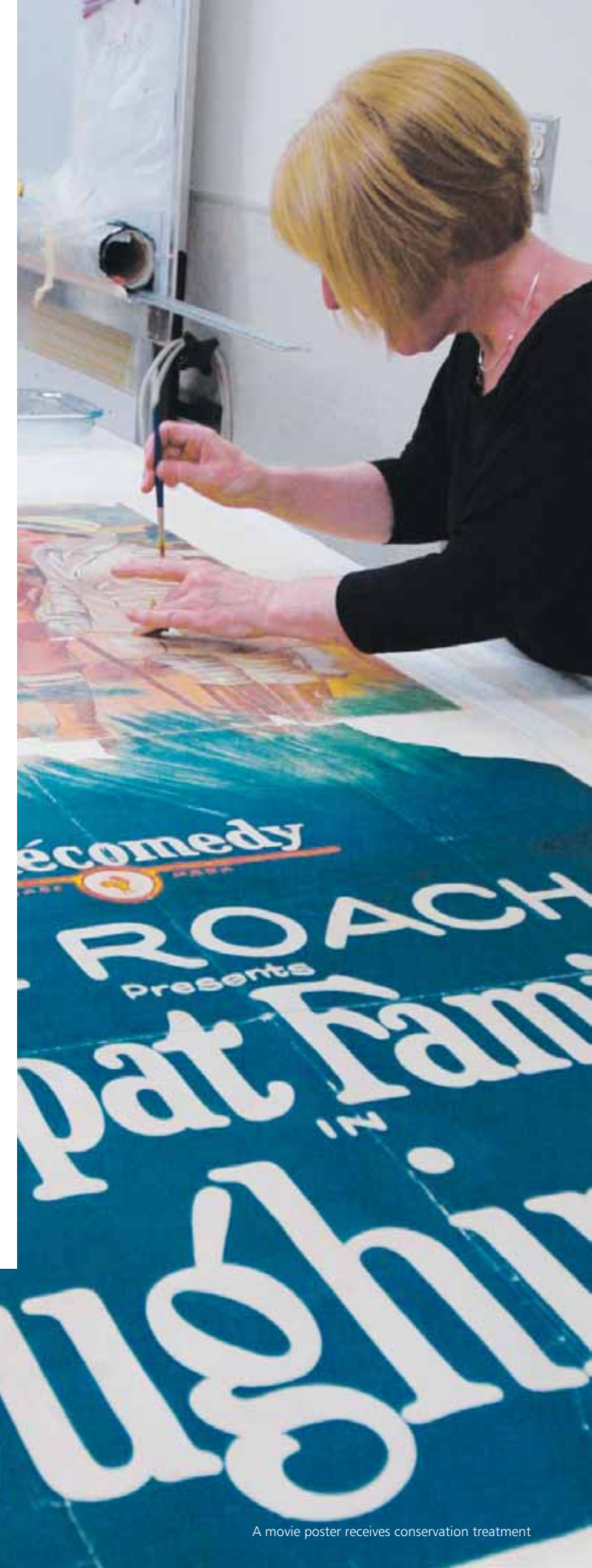
A movie poster receives conservation treatment