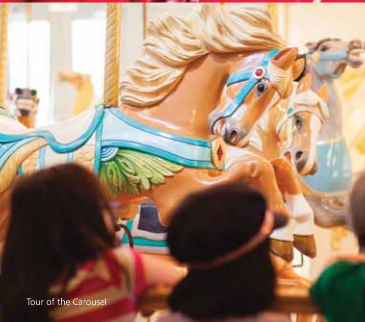
Tour of the Carousel